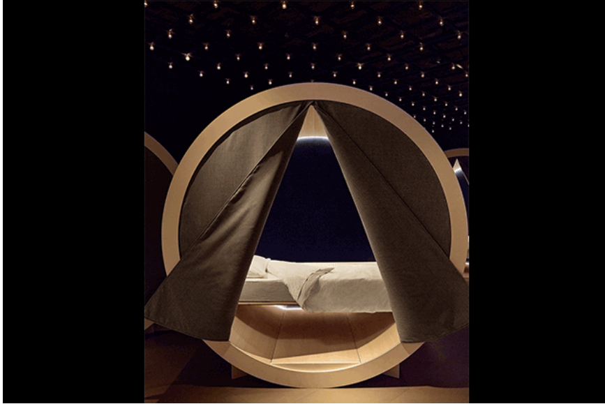
The Dreamery by Casper